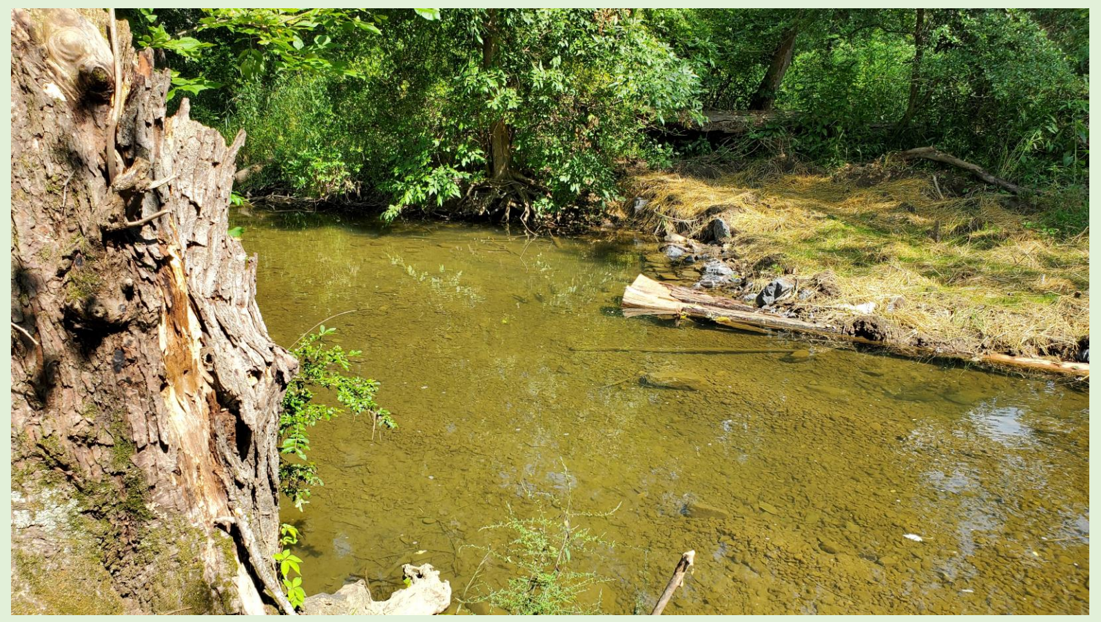
The long deflector at "C".