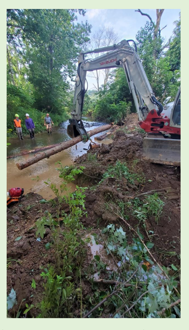
July 19<sup>th</sup> was a short workday due to a broken gas hammer, i.e. "Whacker".